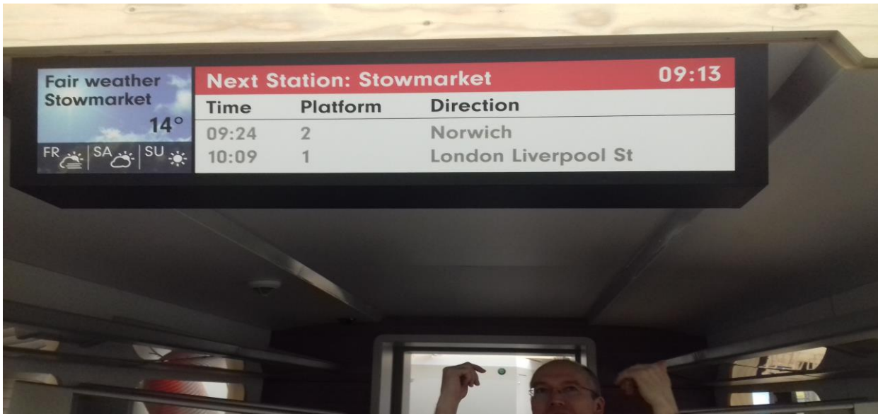
Passenger information showing connecting trains