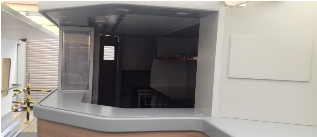
Catering 'café/bar' area